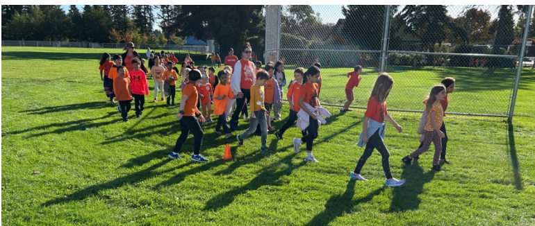
Primary students on their Walk for Truth and Reconciliation