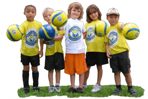
Royal Soccer Club reserves the right to update our programming, policies or terms and conditions per Public Health recommendations due to COVID-19. For more information on our sessions, <u>click here</u> or visit our website FAQs.